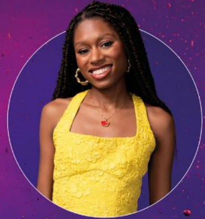
Adjudicated by pianist Isata Kanneh Mason 'One of today's most in-demand classical musicians'

Live Finals Wednesday 11 February 6.45pm · Auditorium